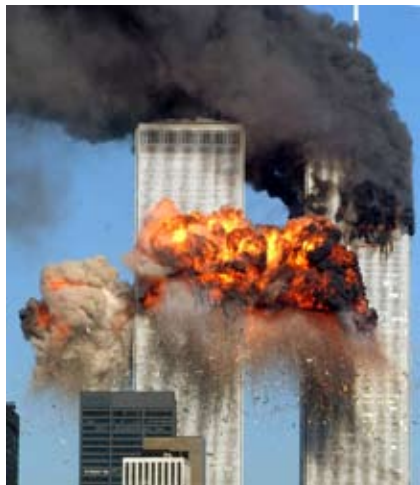
A powerful motivator.

We held our first meeting at a European-themed restaurant in the Chicago suburbs one weekend afternoon shortly after the February conference, and it became our custom to meet at “Euro-