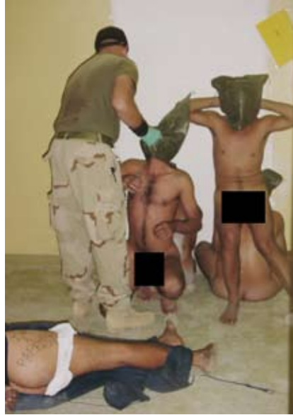
Abu Ghraib: That’ll teach ‘em democracy.

international crusades to spread democracy and engage in nation building, naively asserting that American exceptionalism will somehow protect us from the consequences of bad policies, and who