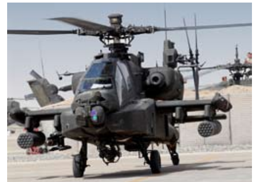
Apache attack helicopter. The Army was no doubt trying to insult Indians with the name.

to the rest of us. ‘Look! What’s that motherfucka doin’ ridin’ through here?! Is he crraaaazy?!’ . . . We caught him on Cavalier Boulevard and knocked him off the bike. . . . Ignoring the passing cars, we stomped him and kicked him. My