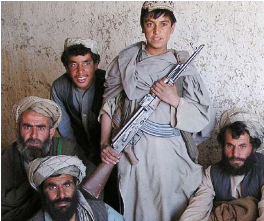
The Census Bureau thinks these Afghans are the same race . . .

that are mixed, so it is interesting that only a small number either know they are mixed or cared enough to say so on the census form. Most blacks appear to be following the “one drop rule.”