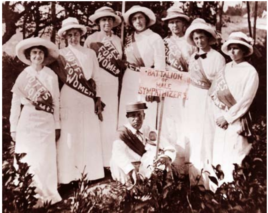
Don’t look for John Derbyshire in the men’s auxiliary.

Race realists will also be familiar with many of the arguments in the chapter on immigration. Mr. Derbyshire has little patience for sentimentalism in any aspect of public policy, and none at all when it comes to immigration—which as he reminds us, is simply another national policy, like farm supports or national parks maintenance. It should be based on the national interest, not on nostalgia or some hazy moral imperative. Mr. Derbyshire deplores what he calls the hypermoralization of immigration, and considers the complicity of “cheerily optimistic conservatives” in this as “perhaps their greatest sin against good sense and proper conservative