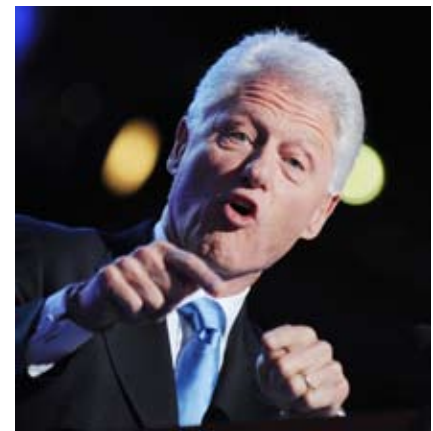
Former leader of our great republic.

"Different populations, of different races, customs, religions, and preferences, can be mixed together in any numbers or proportions at all, with harmonious results. Not only will the