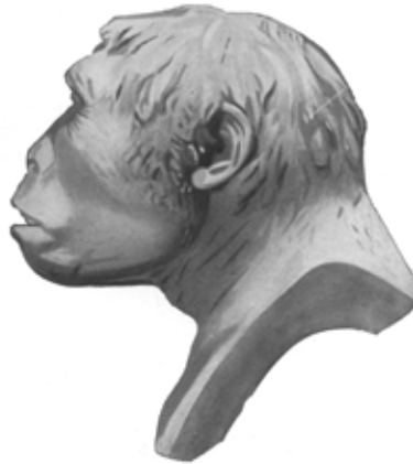
We're all Africans, aren't we?

broke out the non-Europeans, the figure for whites would drop below 50 percent even sooner than the current forecast of 2042 or so. This is a milestone many liberals look forward to; why not give them this victory a little earlier?