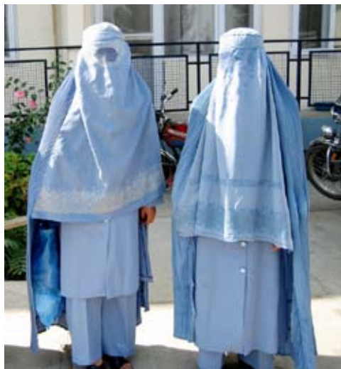
Increasingly common in Europe.

Halal is run by Muslims for Muslims, so non-Muslims have no share in the