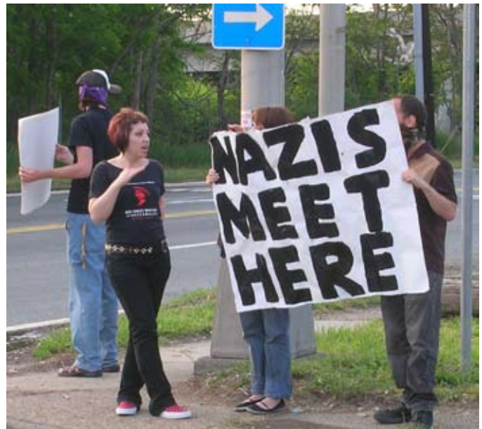
The loonies are not a big worry.