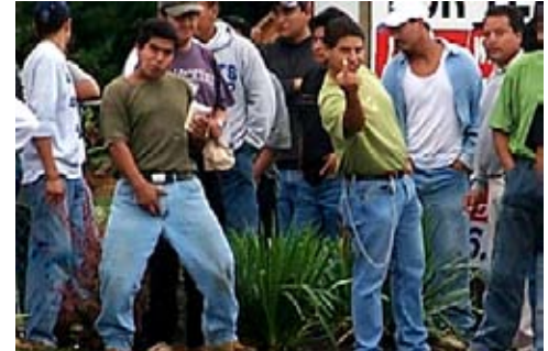
These Mexicans seem well assimilated to us.