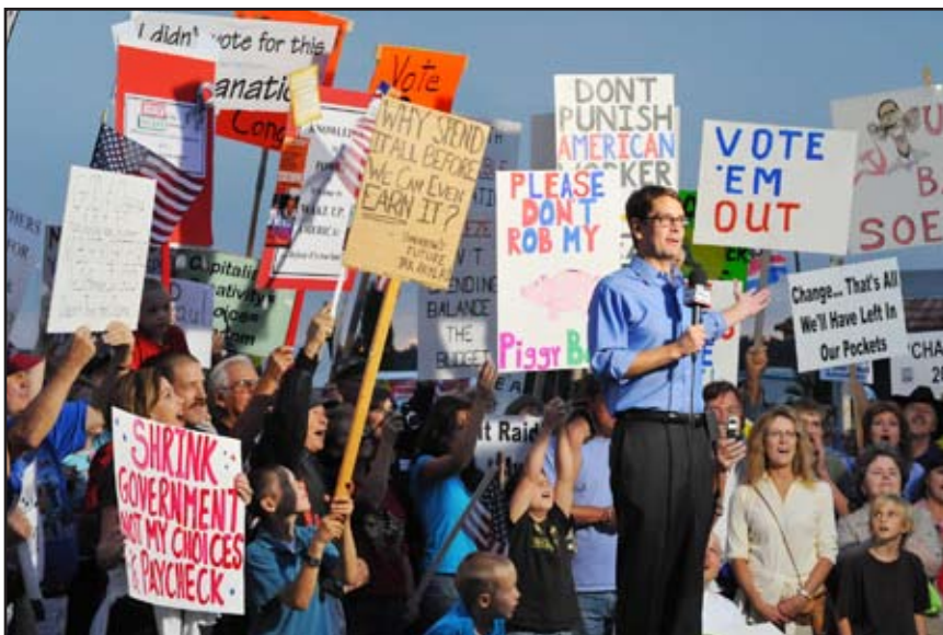
They're all white so they must be racists.

Are things changing? There may be some signs that they are. Barack Obama's endless spending and his ideas about medicine have stirred up vehement opposition, almost exclusively from whites. Lefties insist this is "racism." Actress Janeane Garofalo—although why anyone pays attention to inconsequential twits like her is a mystery—said of the anti-tax Tea Parties, "This is about