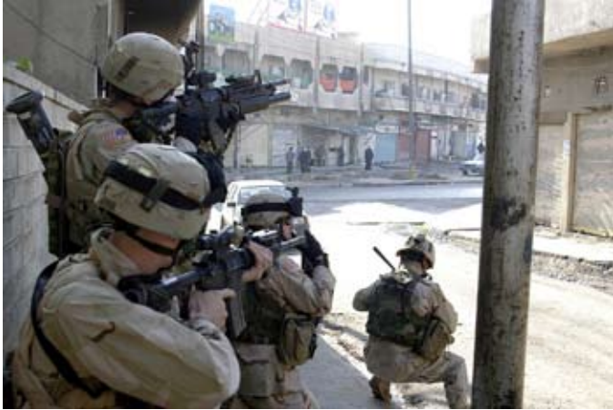
Building nations in the name of empire.

Back in 2004, when it was clear to all observers outside of the White House that George W. Bush's Iraq strategy wasn't working, an unidentified senior presidential aide explained to New York Times reporter Ron Suskind that the "re-