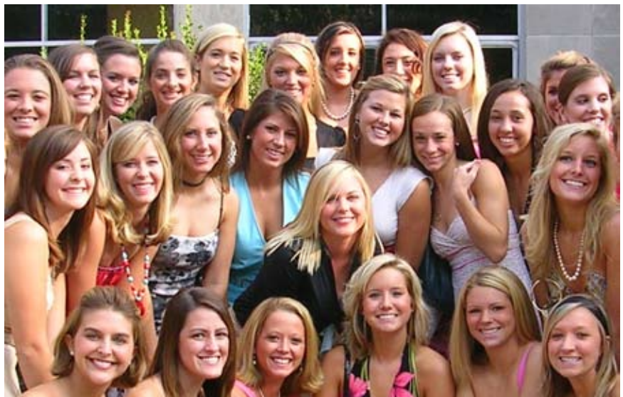
. . . as these American sorority girls.

The census form gives no hint as to whether Portuguese or Brazilians are “Hispanic,” and Brazilians, in particular, are likely to be confused, especially if they are dark-skinned. Officially, the Census Bureau says they are not Hispanic. Nor are Basques or people from Belize or the Azores. However, this has the awkward effect of making lily-white Spaniards potential beneficiaries of racial preferences, while ruling out swarthy Brazilians. Years ago, the Small Business Administration took the lead in rewriting the preferences definition of Hispanics so as to kick out the Spaniards, keep out the Portuguese, but