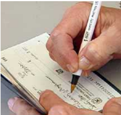
Don't worry, it's for diversity.

In August, the University of Wisconsin at La Crosse announced a tuition hike of $1,320 for each student to pay for more "diversity." The university plans to use the $15 million to recruit 1,000 non-white and poor students, set up 100