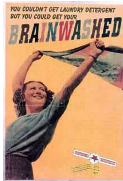
From the Museum of Communism in Prague. Some day there will be a Museum of Racial Egalitarianism.

The endless charges of white racism and oppression that lard the speech of