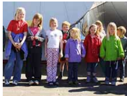
Not a sight to be enjoyed or welcomed.

semble because they fear they won't make it into parliament anyway, and they don't want to waste votes. I, myself, seriously considered voting for the National Democrats because of their greater honesty about race, but ultimately I voted Sweden Democrat because I believed the most important thing was to get restrictionists into parliament. Four more years of the current obnoxious consensus about the blessings of diversity was just too appalling. Unfortunately, the SD didn't make it into parliament, which