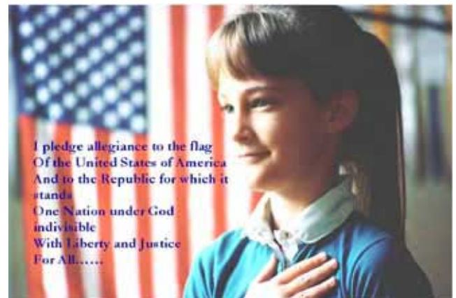
Not nearly black enough.

There are a few other blacks who, like Clarence Thomas, sincerely believe racial preferences are unfair, even if they benefit blacks. One is Ward Connerly, who has been fighting affirmative action for years. After guiding an anti-discrimination ballot initiative to success in California, he established the American Civil Rights Institute to try to promote similar campaigns in other states. Many blacks were furious when Mr. Connerly