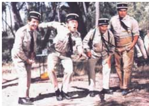
Gendarmes in happier times.