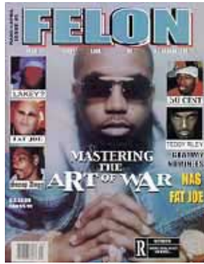
For those who are, and for those who just want to be.