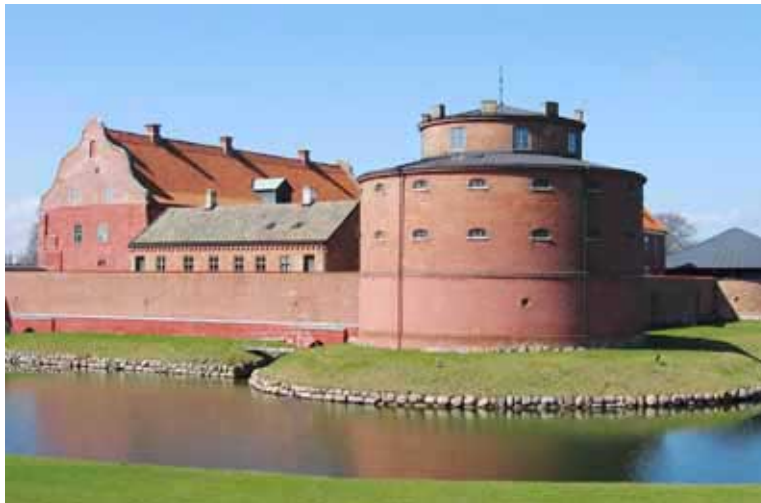
Landskrona, where the most sensible Swedes live. The castle was once considered the strongest in Scandinavia.

The virtual blackout continued. One exception was a "documentary" by Rob-