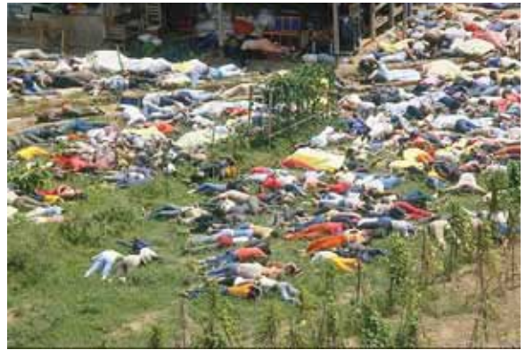
How it all ended.

"revolutionary suicide" by putting a bullet through his head. Ω