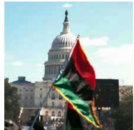
The Garvey flag at the Capitol.

There is intense, combative racial consciousness in the United States because blacks nourish it, take pride in it, find meaning in it, and despise other blacks who do not. The persistence of black racial consciousness in the face of sincere white efforts to practice race-