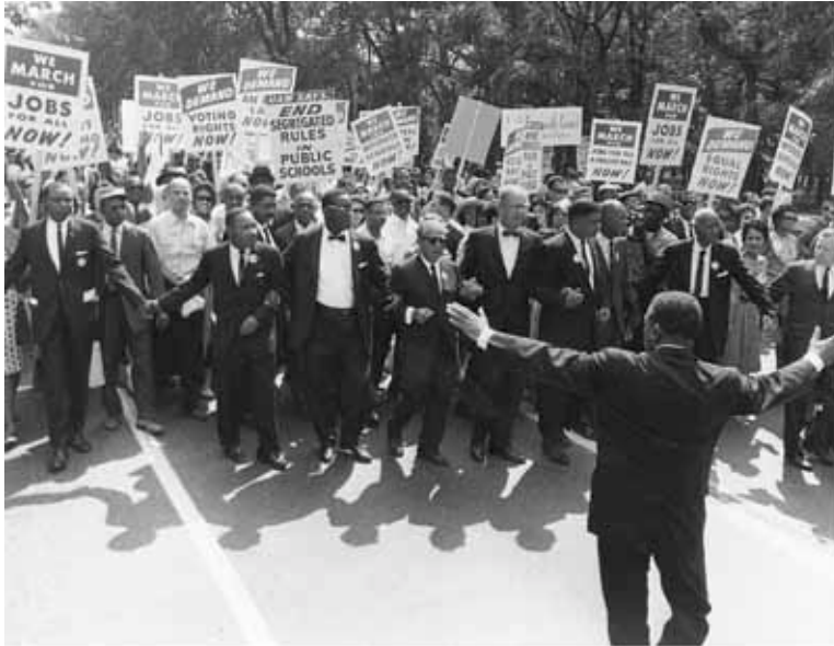
They were never satisfied.

“You have cities run by blacks—the mayor, the police chief, the city council are black; everybody and his mama,