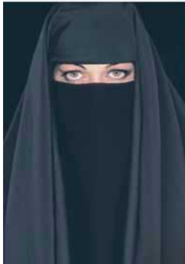
Your nurse, Madam.