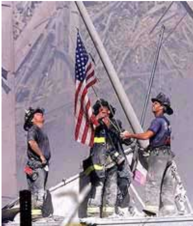
Not the same for blacks.

blacks. The council finally did vote to open meetings with the pledge, but several black members abstained. When the council recited the pledge for the first time, at least one black member stayed outside the room.