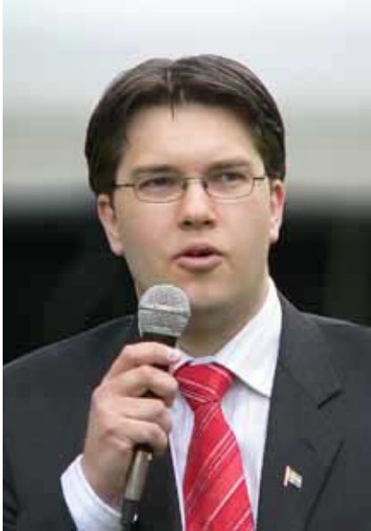
Jimmie Akesson, leader of the Sweden Democrats.

The political establishment—right, center, left—was united in its determination to keep immigration out of the