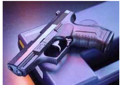
Essential in the new South Africa.

among the most heavily-armed civilians in the world. There are 4.5 million registered firearms in the country, including 2.8 million handguns, and perhaps as many as a million more unregistered.