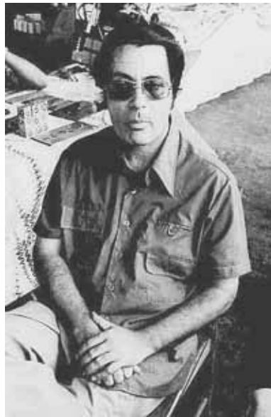
Jim Jones: a multiracialist well ahead of his time.

Despite these honors, there was an investigation of the church for tax evasion, and Jones moved the church again, this time to a commune in Guyana. Jonestown, founded in the summer of 1976 along with about 1,000 followers,