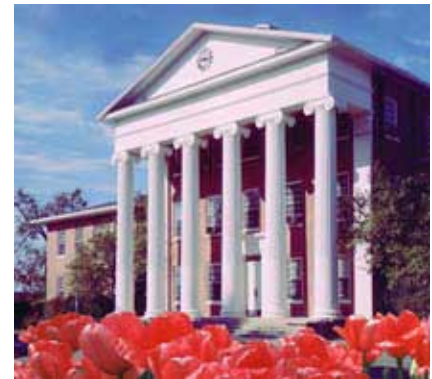
The “Lyceum” at Ole Miss.