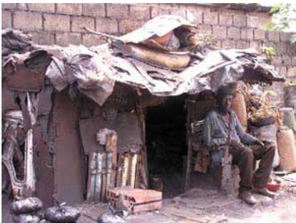
From Kinshasa . . .

of the store manager while another kicked a customer violently in the stomach. The gang dragged the two to the back of the store and tied them up, while they brandished weapons at the other customers. Black Démolition collected wallets, cell phones, car radios, DVD readers, and 2,055 Euros from the cash registers, and roared off in the store manager's Ford.