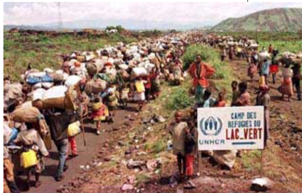
Congolese refugees: How many will end up in Europe?