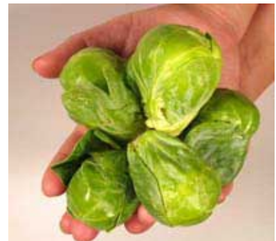
The city is known for something else now.