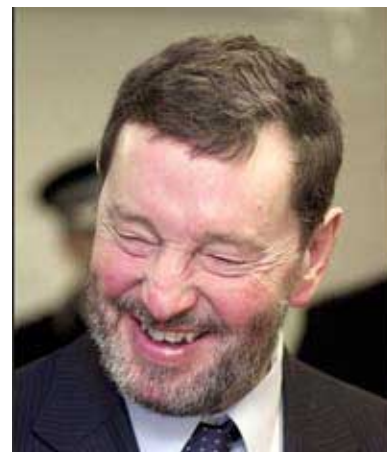
Ex-Home Secretary David Blunkett.