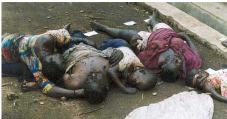
What some of them left behind in the Congo.