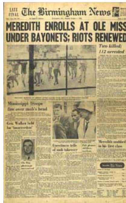
Front page, Oct. 1, 1962.