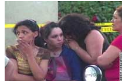
Surviving family members outside the massacre site.