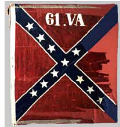
This flag was surrendered at Appomattox Court House, April 9, 1865.