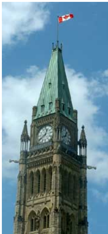
House of Parliament.

On March 21, the Canadian government unveiled a five-year, $56-million campaign to "get tough on racism." The plan grew out of a government survey that found 18 percent of Canadians said they had suffered some form of racial