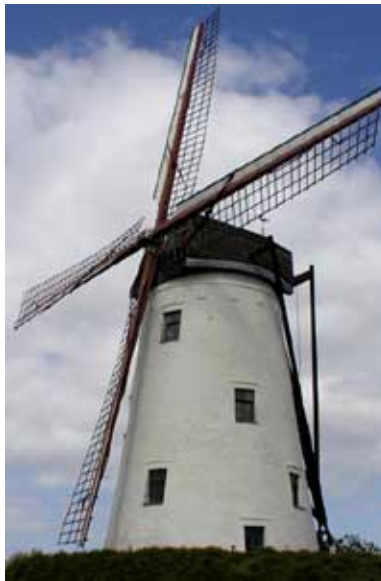
Soon to be a minaret?