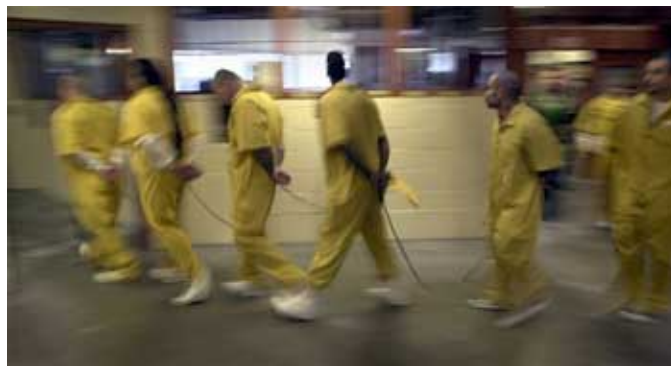
Doing the perp walk.

choose? To Justice Thomas, decisions about race and violence “are better left in the first instance to the officials who run our nation’s prisons.” He accused his colleagues of indifference to the reality of prison life, writing, “The majority is concerned with sparing inmates the indignity and stigma of racial discrimination. California is concerned with their safety and saving their lives.” Justice Thomas even wrote that he thought temporary segregation might survive “strict scrutiny.” Keeping Americans from kill-