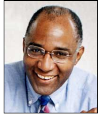
Desperate solutions for irresolvable problems.

ment between blacks and whites. In 2001, the British government set up a plan to eliminate the gap, and in 2003, it put another £10 million into the effort. Needless to say, the British have nothing to show for their money; the gap still yawns. Again, as in America, the British are prepared to try just about anything in the hope of getting blood from turnips.