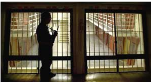
Prison guard on patrol with an assault rifle.

The Southern Ohio Correctional Facility is a maximum-security prison in Lucasville, about 80 miles south of Columbus. In the words of one Ohio supreme court justice, it gets