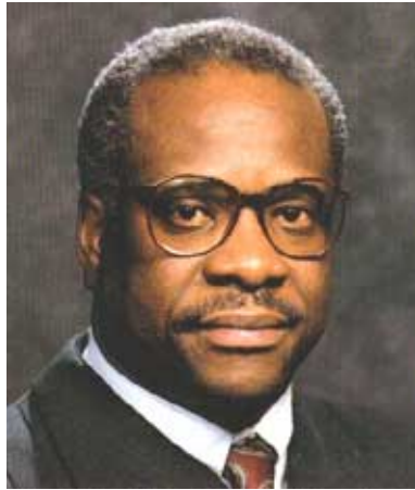
Once again, the justice with the most sense.

prisoners will pay the price for this foolish decision “because the truth is that mixing races and ethnic groups in cells would be extremely dangerous for in-