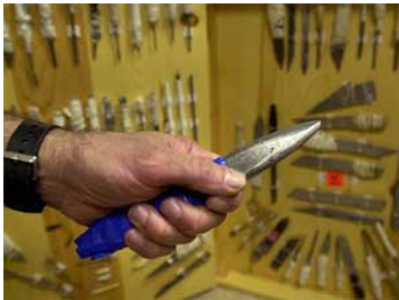
A convict's shiv.

Circuit called this “disingenuous,” adding, “There is little chance that inmates will be forthcoming about their past violent episodes or criminal gang activity so as to provide an accurate and depend-