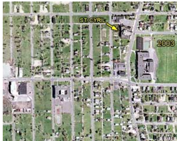
Depopulation: Aerial photographs of the same part of Detroit, taken 54 years apart.

Schools have been getting the axe. The superintendent fired 372 teachers before Christmas, and plans to close 40 schools this summer. According to projections, the number of schoolchildren will decline to 100,000 by 2008, half the 1999 figure. This would mean closing 110 of 252 schools, and firing more than a quarter of the district’s 21,000 employees.