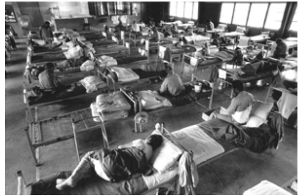
A prison dormitory.

The Ninth Circuit also refuted Mr. Johnson’s argument that the policy of temporary segregation increased racial animosity by perpetuating racial stereotypes. It pointed out there was already plenty of racial tension in prisons with or without segregation, and that it was silly to argue that a measure designed to keep violence down was actually increasing it. Mixing up the races in cells would probably lead to more racial violence, not interracial friendship. The court also went to great pains to point out just how pervasive racial tension is in California prisons. It listed case after case in which racial gangs attacked each other, and noted that some prisons have been kept locked down for years at a stretch because race riots would erupt if there was