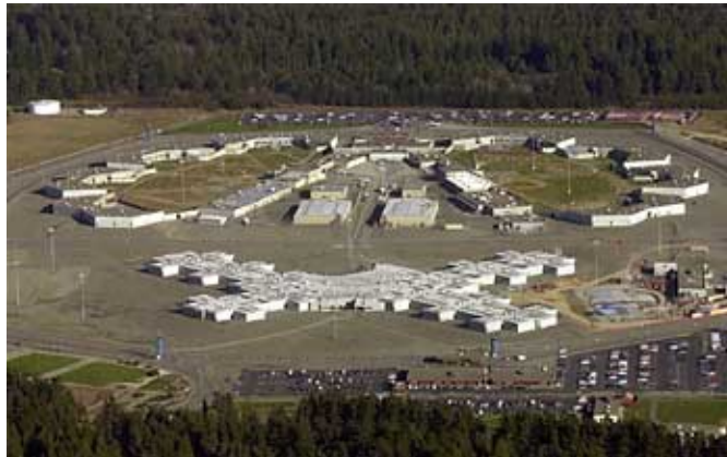
Pelican Bay: the worst of the racial gang leaders live here.