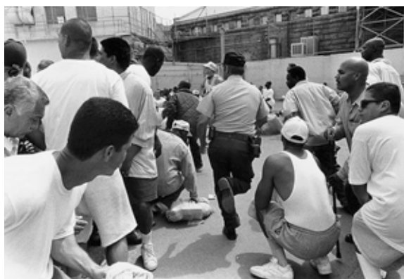
A guard runs to break up a prison-yard fight.

For prisoners in most states, aside from the fact of incarceration itself, race is the central reality of life. For California prisoners, race-based gangs are often the very key to survival. Gangs protect members from other gangs, and are