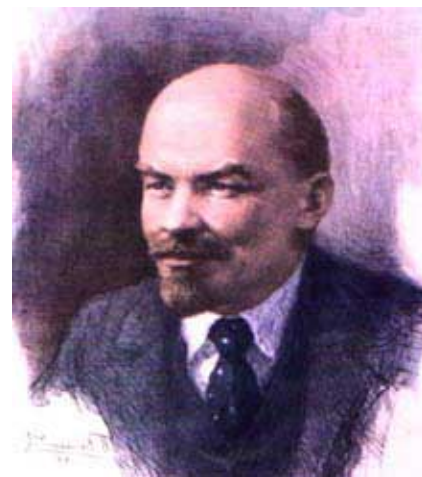
The father of political correctness has countless progeny in America.

When I lived in Russia, I was an avid listener to the Voice of America, and was under the impression that the situation in the United States was completely different. The many ethnic groups and races all considered themselves American, spoke one language and shared the