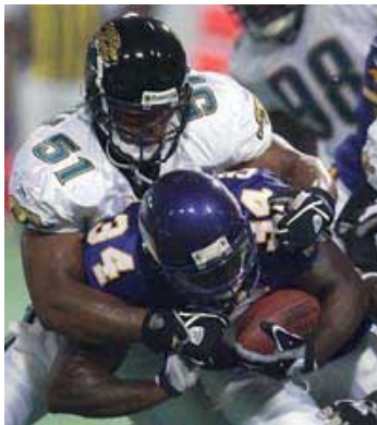
Good training for assistant principals.

Atlanta that was virtually all white—typical suburban children from typically suburban families. At first, there were few blacks, and again, other than their skin color, they were pretty much like the rest of us. Then DeKalb County started something called the "Majority