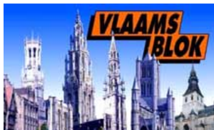
No minarets in this picture.

Belgium’s Vlaams Blok is a nationalist party that calls for secession of Flanders from Belgium, withdrawal from the EU, and tough restrictions on immigration. The Blok would deport all illegal immigrants immediately, and let legal immigrants stay only if they speak Flemish, know Flemish laws and history, and are approved by Flemish neighbors. Few of the Turks and Moroccans who live in Belgium would be able to stay.