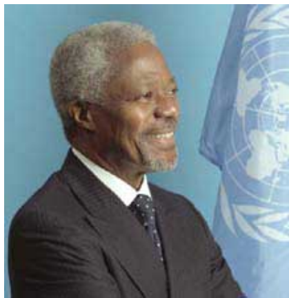
Coming to a polling station near you?

A group of congressmen, led by black Texas Rep. Eddie Bernice Johnson, have sent a letter to UN Secretary General Kofi Annan asking the United Nations to send election observers to monitor the US presidential election in November, in