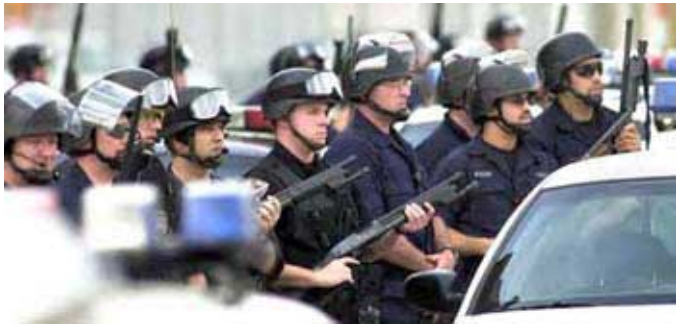
What it took to stop them the last time.