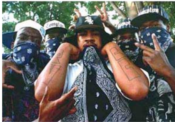
Bused in for your enrichment.

I was born in Wichita, Kansas, in 1958, and have always known blacks were different from whites: louder and more animated. Still, I did not think much about this until I went to junior high school in 1970. That was the year forced busing began in Wichita. Blacks beat whites for no reason, and shook them down for pocket change. It was shocking to us. The few blacks who had been with us in earlier grades were not that