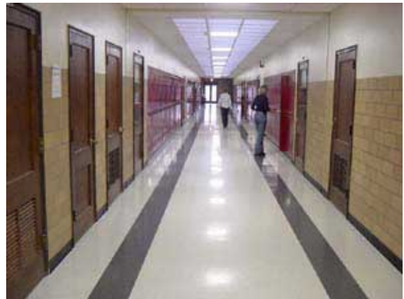
Can be both dangerous and educational.

By my mid-30s, I was firmly convinced that blacks are a problem for white society but I didn't see a moral justification for doing anything about it. I had