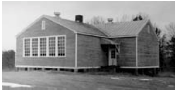
Segregated black schools in Virginia in the early 1960s . . .

ruling sink in, before issuing another ruling on how to do what the Court ordered. It is here that we find the famous linguistic fudge: desegregation was to be accomplished with “all deliberate speed.” The South was going to have to abide by the Constitution, but it could drag its feet. “It was entirely unprincipled,” Elman wrote in 1987; “it was just plain wrong as a matter of constitutional law, to suggest that someone whose personal constitutional rights