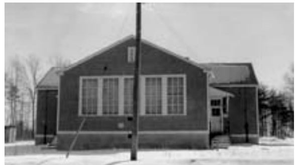
. . . more money would not make much difference.

Still, every court order so far had been directed to schools in the once-segregated South. The rest of the country could look on in smug superiority as Southern whites battled busing, set up private schools, fled to the suburbs and, in some cases, even closed down public schools rather than submit to “racial balancing.” At least in the South, whites clearly did not like forced race-mixing, and would go to great lengths to avoid it. To the elites of the time, this was precisely the kind of prejudice busing was