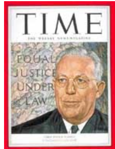
Earl Warren: another hero to the liberals.