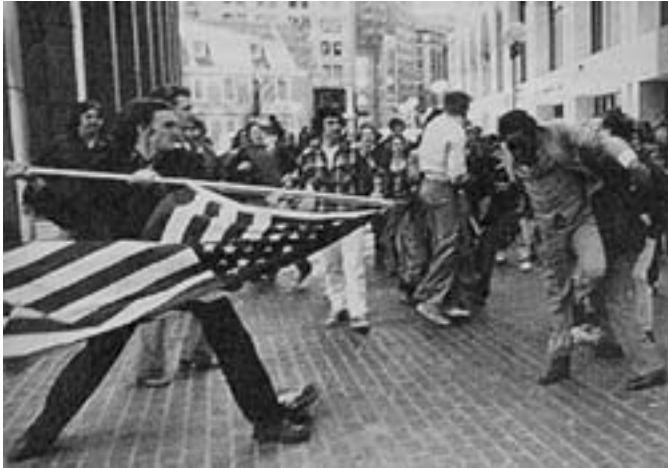
Protest against busing in Boston.

“racial balance.” This, however, was the effect of the new Court rulings. It was as if blacks and whites had to check with a central authority whenever they wanted to see a movie, and were directed only