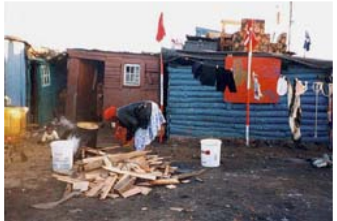
A slum in South Africa.

Two sociologists from the National Council of Scientific Research in France recently conducted a survey of minors who were convicted between 1985 and 2000 by the courts of Grenoble, a city in the southwestern French district of Isère. They found that although immigrant families make up only 6.1 percent of Isère's population, an astonishing 66.5 percent of the convicts had a foreign-born father, and 60 percent had a foreign-born mother. The fathers of 49.8 percent of the offenders were from northern Africa. This is a nationwide problem. The Institut National des Statistiques et des Études Économiques has found that 40 percent of French prisoners had a foreign-born father; 25 percent had a father born in northern Africa. One researcher writes, "The overrepresentation of youths of foreign origin among juvenile delinquents is well known, but this fact is little reported and never debated in the public sphere." [Selon une Étude Menée en Isère, Deux Tiers des Mineurs Délinquants sont d'Origine Étrangère, Le Monde (Paris), April 15, 2004.]