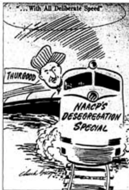
From the Baltimore Afro-American , July 2, 1955.

should never preempt law-making by elected representatives; republican government has been badly eroded by the process set in motion by Brown .