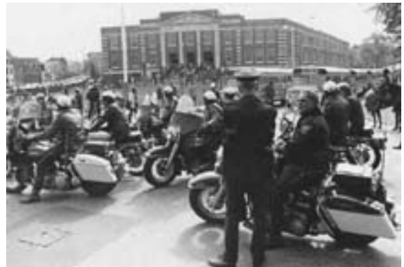
What it took to do it.

Busing in Boston was perhaps more traumatic and disruptive than anywhere else. In 1967, the public schools were 73 percent white. The average black student, however, attended a school that was only 32 percent white, which means schools were substantially segregated. This reflected the fact that most blacks were clustered in Roxbury, in the southern part of town. Court-ordered busing came in 1974, but the mere rumor of it was enough to send whites to the suburbs. By 1973, white enrollment had