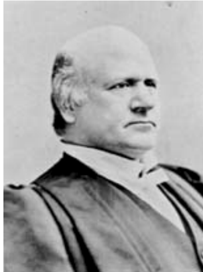
Justice John M. Harlan

visions as beyond the scope of Congressional power under the 14th Amendment . In what became known as the “Civil Rights Cases,” the Court asserted that the rights protected by the Amendment were exactly those defined—to own and convey property, enforce con-