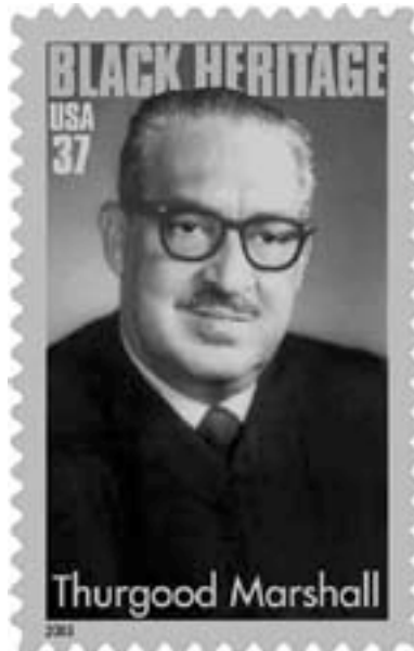
He is now a hero.

Marshall started and ended was weak. He leaned heavily on the work of Kenneth Clark, a black researcher known for doll studies. Clark reported that if he showed a pair of black and white dolls to black children attending segregated schools and asked them which doll they liked better, a substantial number picked the white doll. He argued to the Court that this proves segregation breeds feelings of inferiority. He failed to mention that he had shown his dolls to hundreds