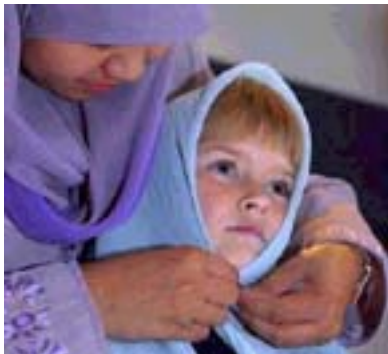
The fate of the West?

in Thann for wearing the scarf. School authorities allowed her to attend another area school on the condition that she wear a much smaller bandanna rather than the head-and-shoulders hijab , but after a few days, she showed up in full regalia. Teachers went on a day-long strike to protest her disobedience, and