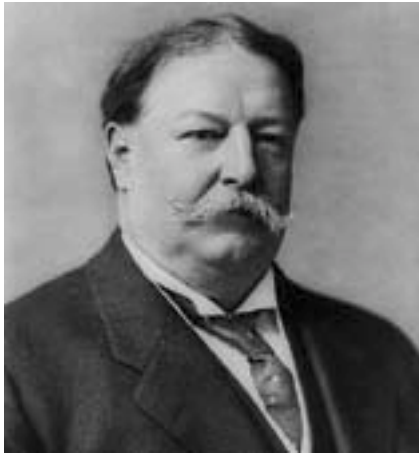
Chief Justice William Howard Taft . . .

Before 20th century theories about racial equivalence, people took it for granted that racial differences justified different treatment. As the Georgia Su-