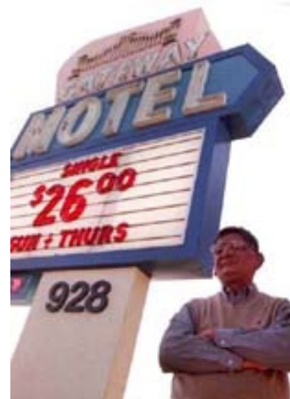
A Patel and his motel.