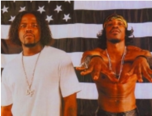
OutKast: Democratic strategists?