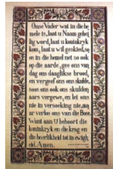
The Lord's prayer in Afrikaans.

At first, the official push toward Creolization met with little resistance, and was even welcomed in liberal or left-