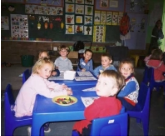
Their language protects them.

Yet one should not underestimate the thousand little resistances carried out every day, in schools, companies, hospitals and elsewhere. Whole suburbs in Pretoria are policed not by the South African Police Department—completely black, with corrupt cops and hardened