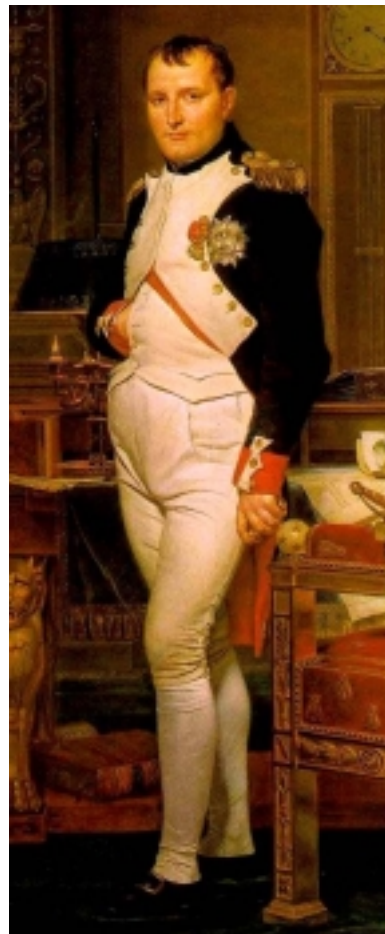
Napoleon did not.

Of the 4,002 important people Dr. Murray surveys, women constitute a mere 88, and nearly half are in literature. There are a number of non-Westerners like Arabs, Indians, and Chinese on his list, but Africa and the Negro race are not even a blip. No gushing about the mind-bog-