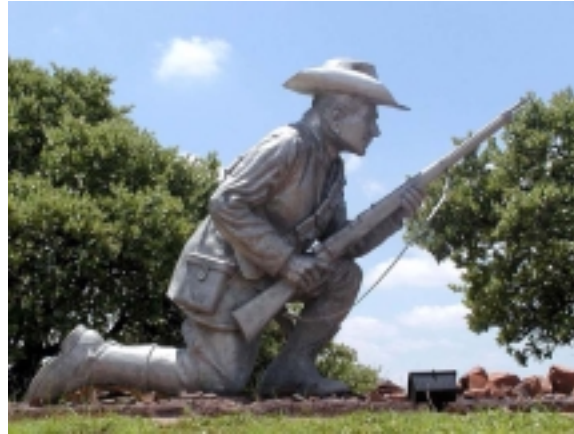
Danie Theron, a hero of the Boer War.

The ham-fisted way the South African government is trying to suppress the Afrikaner identity in favor of an imported quasi-American multiculturalism mixed with warmed-over pan-Africanism, is bound to provoke the slumbering Afrikaner spirit of resistance. The dogged