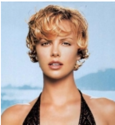
Charlize Theron: a Boer beauty.

The English South African novelist and 1991 Nobel prize winner Nadine Gordimer made a career out of caricaturing Afrikaners as oafish racists living out on farms, where they drink brandy, torture natives, and practice incest. In at least one respect she was right. Like the patricians of republican Rome or the peasant farmers of Western Europe from whom they sprang, the Boers derive their