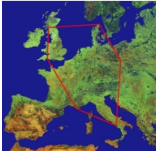
Where the geniuses lived.

ish culture discouraged innovation and scorned interaction with the gentile world, whether it was receptive to non-Christians or not. Spinoza, after all, was