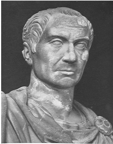
Julius Caesar made the cut.

writes on the first page of his introduction, “They have discovered truths about the workings of the physical world, invented wondrous devices, combined sounds and colors in ways that touch our deepest emotions, and arranged words in ways that illuminate the mysteries of the human condition.”