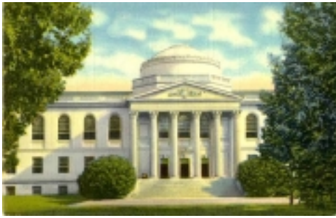
UNC: keeping an eye on “white, heterosexual, Christian males.”

feel entitled to make violent, heterosexist comments and not feel marked or threatened or vulnerable.” The follow-