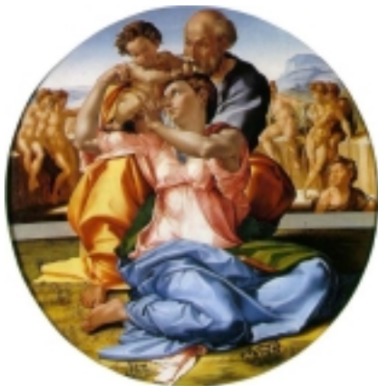
Western art has gone from this . . .

18C [the 18th century], prompted by the Enlightenment and the Industrial Revolution.” The disruption of Western cul-