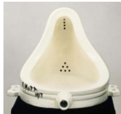
. . . to this.