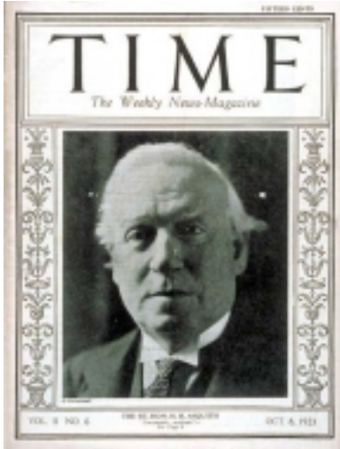
Herbert Asquith on the cover of Time , October 1923.

Many British converts have been inspired by the writings of Charles Le Gai Eaton, a former diplomat and author of Islam and the Destiny of Man , who says,