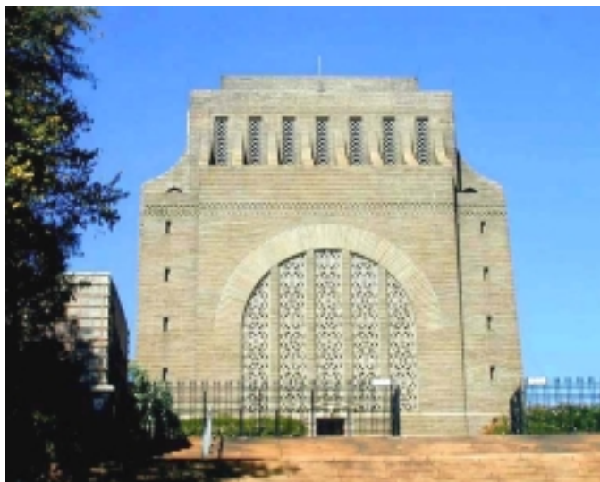
The Voortrekker monument: Is another Blood River in the making?

at the time of the revocation of the Edict of Nantes. The product must obviously be one of the most rugged, virile, unconquerable races ever seen upon earth. Take this formidable people and train them for seven generations in constant warfare against savage men and fero-