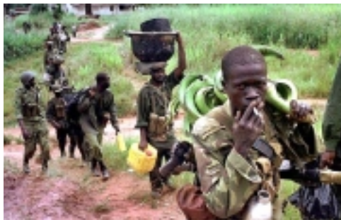
Congo fighters: What's going into the pot?

Hema, tall herdsman similar to the Tutsis of Rwanda, and the shorter Lendu. The Hema took over the plantations the Belgians left behind when they fled in 1960, while the Lendu are subsistence farmers who originally occupied the land. For some time, rumors of atrocities—especially of cannibalism—have trickled back to civilization, and there have now been enough reports to leave little doubt that some Congolese are eating each other (See AR, March 2003, July 2003, Dec. 2003).