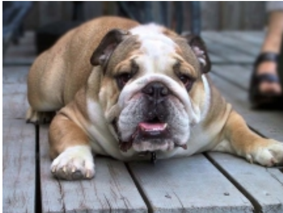
Dog breeds vary tremendously . . .

Furthermore, this particular “illusion” is proving to have very concrete uses. Police can now easily test DNA samples