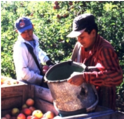
Hispanics don’t want them here either?

is not much sign of Hispanic resistance to immigration, but claimed that many Hispanics are completely “red, white and blue” and that Hispanic opposition to immigration is a “sleeping giant” beginning to stir. He seemed entirely sincere—he got a good round of applause when he said all illegals must be rounded up