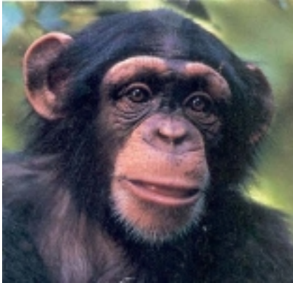
Some human groups are physically . . .

“Human races are very strongly marked morphologically; human races are very young; so much variation developing in so short a period of time implies, indeed almost certainly re-