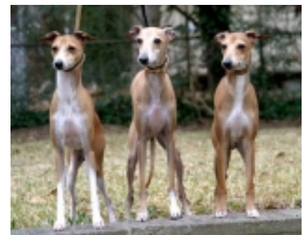
. . . but are genetically almost indistinguishable.

Comparisons with monkeys underscore the significance of human races. A series of measurements on skulls yields an index of difference from one population to another. By this measure, human races are as different from each other as are different species of chimpanzee. In fact, a comparison of the most widely divergent human groups, such as Norwegians and Australian Aborigines finds physical differences as great as