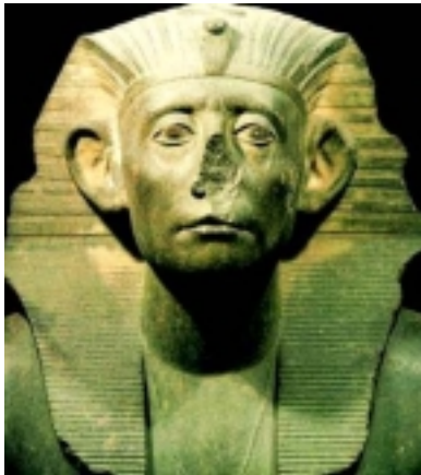
Sesostris III wanted blacks out.

obviously wrong, but since so few of the people who know better are willing to say so, this nonsense is beginning to tighten its grip on the popular mind. Now a book has finally appeared that blows to bits every one of these tendentious arguments. Race is a long overdue corrective that deserves wide circulation.