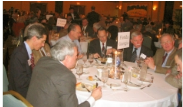
Participants from the southern contingent enjoy the banquet.