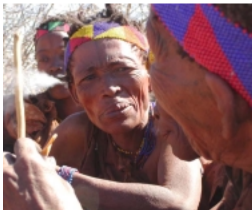
Among the zhu .

Greek and Roman art works that depict blacks and whites together sometimes show blacks with larger penises, often erect. Herodotus noted the physical characteristics of blacks, especially their “wooly” hair, and Hippocrates speculated that generations of exposure to the sun had burned them black. The ancients realized that racial characteristics were permanent. Jeremiah, for example, asks rhetorically, “Can the Ethiopian change his skin, or the leopard his spots?”