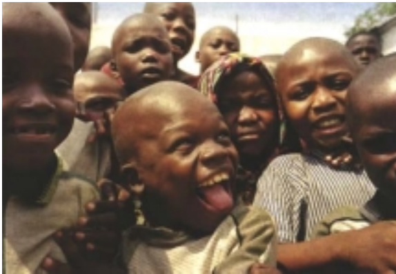
Congolese child witches.

children wander the streets of Kinshasa, and at least 60 percent of them are accused witches. Many fall in with street gangs that steal and scrounge for food. Girls as young as five work as prostitutes. Some of the older children are vio-