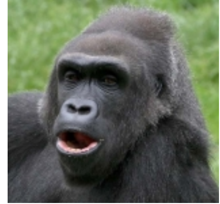
. . . as dissimilar as chimps and gorillas.

ministrative consideration of race, with employers and colleges free to make decisions strictly on merit. Presumably they support repeal of all anti-discrimination laws, which would leave businesses free to choose their customers and homeowners their neighbors. This book says nothing about immigration, but a meritocratic approach presumably means restrictions based (only) on ability.