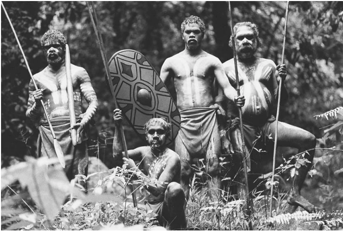
What's their average IQ?

mogeneity. A UN study of the years 1989 to 1992 found 82 conflicts that resulted in 1,000 or more deaths. Of this number, no fewer than 79 involved ethnic or religious antagonists, and took place