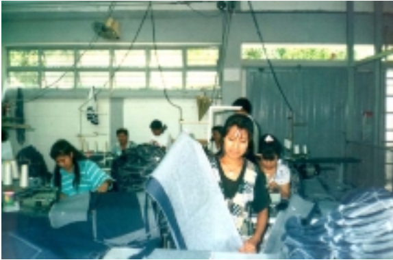
Jobs heading south: Mexican maquiladora.

man who is a gynecologist and still has a practice. He got a big laugh when he imitated a thick Southern accent, and quoted his colleague: "I have done an informal poll of my patients and have found that amnesty is about as popular as genital herpes."