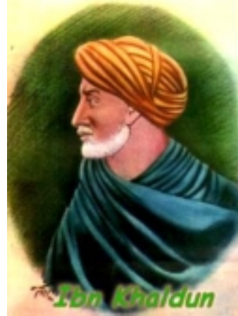
He didn't like them either.

Among the Arabs, people of any race could be enslaved, but blacks were as-