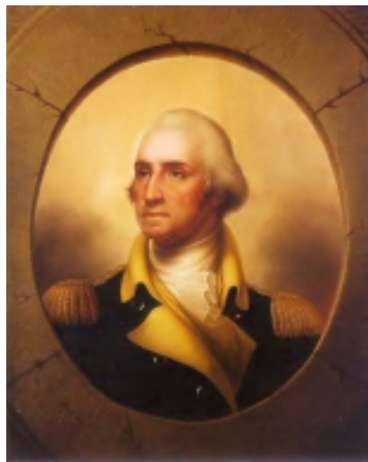
Not fit to name a school after.