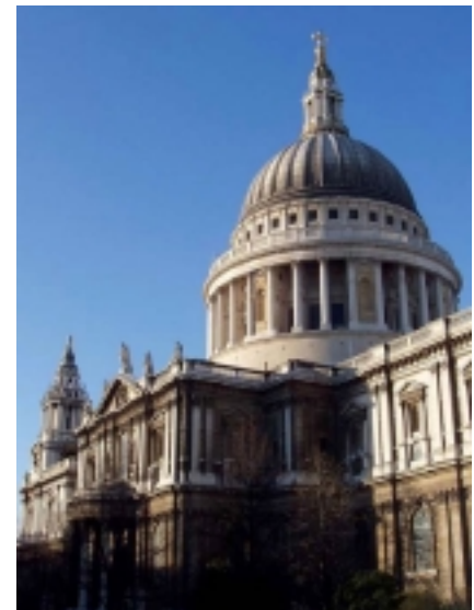
St. Paul's: soon to be a mosque?

The Right Rev. Richard Holloway, also a BSC member, notes that some-