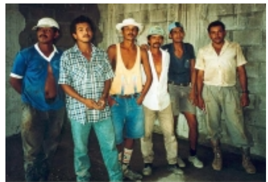
They head north.

Is there really as much anti-immigrant sentiment among Hispanics as K.B. Forbes claims? If there is, it is probably