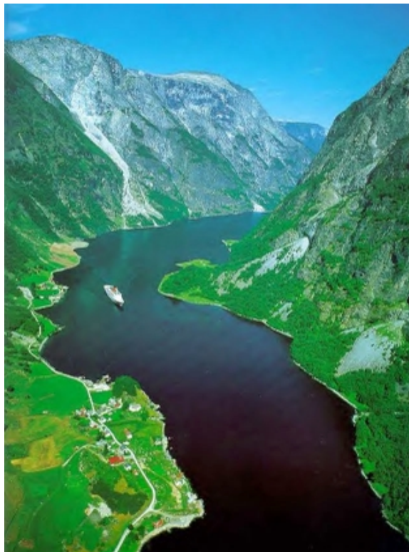
Is the boat coming or going?

Of the three countries, Sweden has the strongest legacy of racial egalitarianism, due to the tremendous influence of Gunnar Myrdal and Prime Minister Olof Palme. Myrdal, who had a world-wide reputation as a racial liberal, influenced