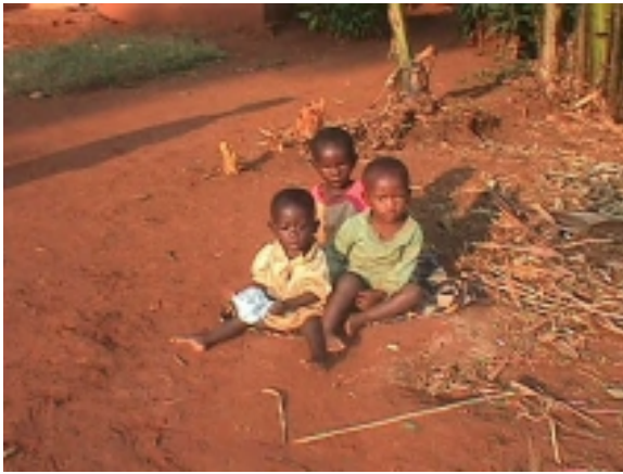
Not on the safari circuit.

thing stolen. "That's very Janiceburg, very Jozi," one resident later told him.