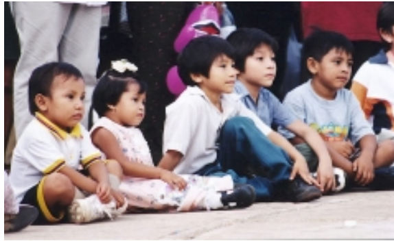
This is America?