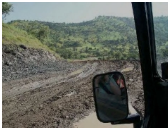
Typical African road.

"Mozambique," he writes, "was not a country in decline—this part of it, anyway, could not fall any further." Of its capital city, "It was hard to imagine how much worse a place had to be for a bro-