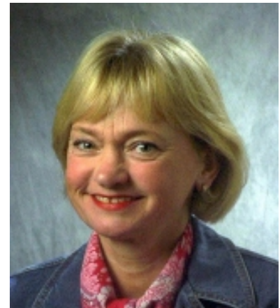
Straight-talking Pia Kjaersgaard.

Still, after 1998, as the problems associated with immigration rose, so did the party's fortunes. Violent crime, especially rape and robbery, were increasing sharply, and an astonishing 68 percent of all rapes are now committed by immigrants. At just five percent of the population, this means immigrants commit rape at no less than 40 times the native rate. As in Sweden and Norway,