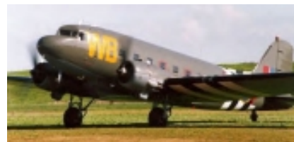
The great cargo bird.