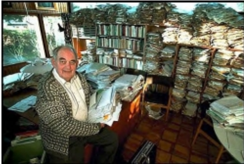
Mogens Glistrup: out of jail and in his office.

If Swedes don't leave non-white areas voluntarily, they may be forced out, since some immigrants are turning their neighborhoods into “no-go zones” for whites. In Rosengard, in the very center of Malmo, anyone who appears to represent Swedish society is likely to be met by young stone-throwers as part of their