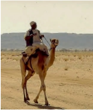
Best way to get around Khartoum.

In Zimbabwe, he visited a farm run by a charming hard-working white family $22 million in debt and assailed by squatters. He spoke to one of the latter, who was from neighboring Zambia. He was furious because the government had not helped him. He needed seed, fertilizer, and a tractor. He now expected the owner of the farm to give him supplies and plow his fields. “Having invaded the