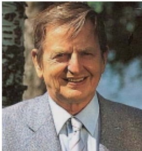
Olaf Palme: a big part of the problem.

victory. The vehicle was the populist Skane Party, which favored immigration control, lower taxes, a liberal alcohol policy, and self-rule for the southern Swedish province of Skane, which includes the city and county of Malmo. It won election to the Malmo County coun-