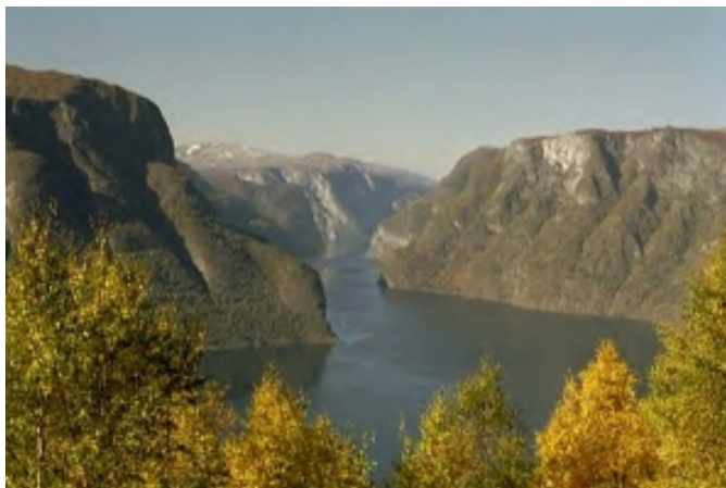
Scandinavia: future home for boat people?

Meanwhile, Sweden’s demographics are changing rapidly. Not only is immigration increasing, non-white immigrants have at least twice the birth rate of Swedes or of immigrants from the West. Somali immigrants have the highest birth rate, at more than three times the white rate. More than half of all So-