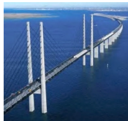
Time to close down the Oresund bridge?

Still, Swedish politicians are able to undermine the new Danish immigration laws to some degree, because Sweden and Denmark are members of the European Union (EU), which guarantees free movement of people within its borders. Since the new Danish laws were passed,