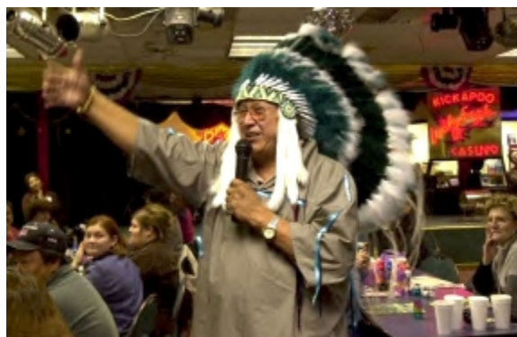
Make him pay taxes.

As everyone now knows, California is struggling to cover a $38 billion budget deficit. As it happens, there is a whole class of Californians who do not pay