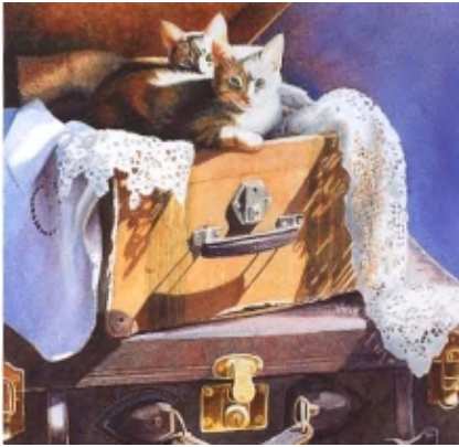
Cats on a suitcase.

Many of my clients are unable to explain even the most basic facts. Often they must take the witness stand, and no matter how many times we have gone over the testimony in advance, I can be