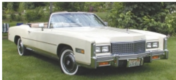
More important than house or kids?

called. A black debtor—not my client—was before the judge trying to convince him to approve his bankruptcy repayment plan. The judge told him he could not afford both his Cadillac and his children, and had to give up one or the other. The debtor immediately said he could not give up his car, and therefore the judge would have to take his kids. The judge threw up his hands and walked off the bench. On another occasion, the same bankruptcy judge told a black