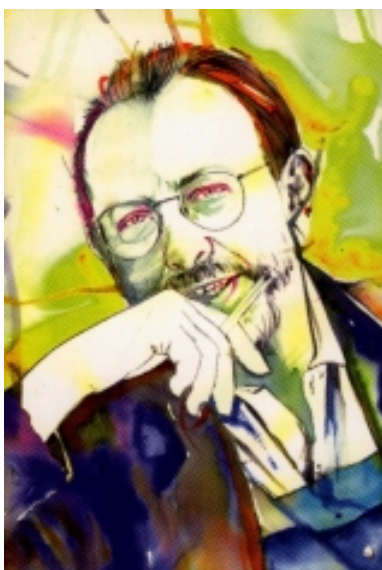
Alain de Benoist

facts and basic political and social issues hushed up, and dissidents silenced as bigots and haters. The consequences have been catastrophic: political unresponsiveness, bureaucratic tyranny, unchecked cultural degradation, and—to