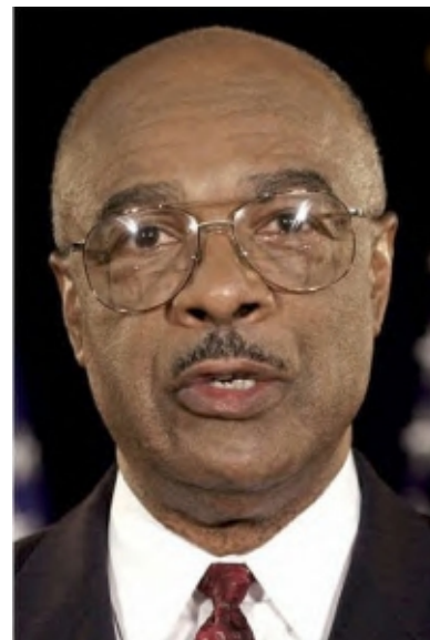
Rod Paige: fake miracles.

The Houston, Texas, school district has been the crowning achievement in "the Texas miracle," according to which the state has made impressive progress with "at risk" students. It was largely on the strength of Houston's glowing record