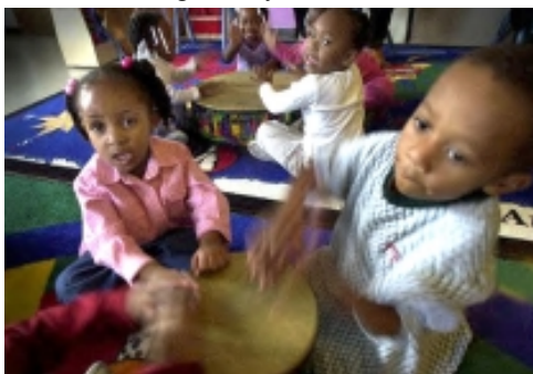
Seventy percent are "outside kids."

Children do not always seem to have the same importance for blacks that they do for whites. I was in bankruptcy court once waiting for my client's case to be