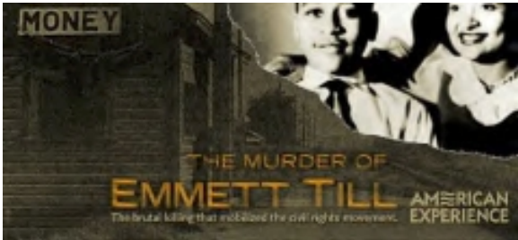
Big news to this day—PBS touts a “special.”