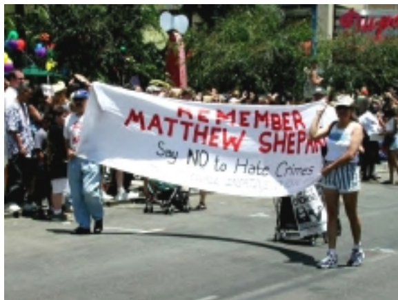
No marches for Missy.

It was in this state of mind that the four returned to the trailer where the three blacks lived. The men offered Miss