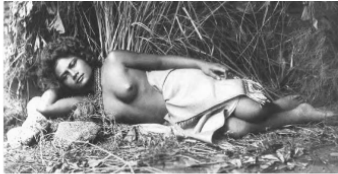
Samoan girl: Happy little sex fiend?

That’s all swell, except that (a) the members of an ethnic group are all alike, in that they are closer genetically to each other than to members of other groups and (b) no one seriously claims that every black is intellectually inferior to every white, let alone that blacks and whites “differ fundamentally.” The point is that modern psychology (and increasingly, biology) shows that blacks on av-