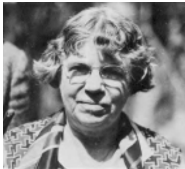
Margaret Mead wanted to believe it.

erage have significantly lower intelligence than whites. If the norms of a society are to be determined by what is true on average of its members (as social norms almost always are), then the racial differences in IQ are socially significant. How the society will define and institutionalize that significance is another matter, and not one necessarily determined by science.