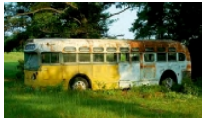
Worth more than your house.

In 2001, the Henry Ford Museum in Dearborn, Michigan, paid $492,000 at auction to buy an old, rusted, junker of a city bus. It was alleged to be the very