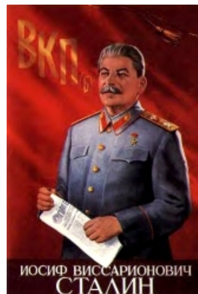
Blank slate-ism run amok.

(the idea that human nature changes or can change for the better over time), the capacity of human beings to mold their own nature and their societies to their preferences, the equality of human be-