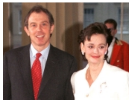
Tony and Cherie.

On Mrs. Tony Blair: "Not that I'm calling Cherie Blair a whore. She