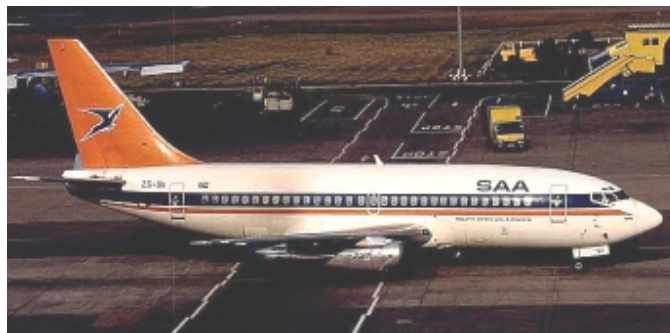
... the fact that the old white-run SAA was a much better airline.

The problem is exacerbated by a code sharing agreement with Nigerian Airways, according to which flights from Johannesburg stop off in Lagos before going on to New York, allowing many Nigerians a route into the US. Nigerian Airways, by the way, has one aircraft, but is banned from flying to Europe or