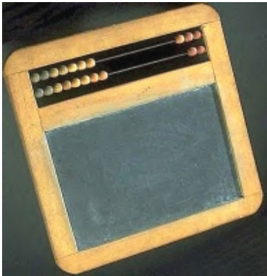
What liberals wish we were.

In the recent film thriller Red Dragon , actor Ralph Fiennes plays a serial killer whose psychopathic urge to commit murder is the product of his upbringing by an abusive grandmother. Unfortunately for the producers, the film and the book on which it is based were written and produced before the appearance of Steven Pinker's The Blank Slate ,