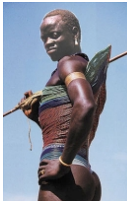
Dinka in Sudan.