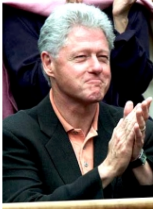
Devoted to curing AIDS.