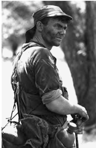
Rhodesian Selous Scout. Was he fighting for his race and civilization or was he fighting communism?

Jefferson, and a whole universe of assumptions about human nature, human society, science, religion, ethics, and cultural values—assumptions that can no longer be taken for granted. So secure was this cultural consensus among almost all whites that racial consciousness really did not need to appeal to race itself very much or very directly. Today, that shared cultural (and political) fab-