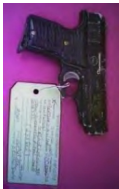
The murder weapon.