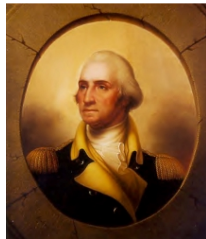
Father of his country or wicked white man?