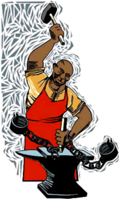
As they see him.

On the 202nd anniversary of his hanging on Oct. 10, 1800, the city council voted unanimously to rehabilitate Prosser. "This resolution seeks to cor-