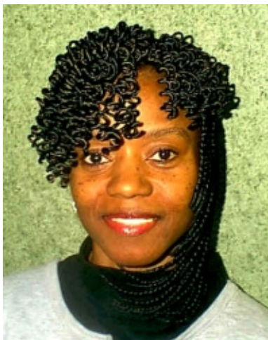
Wash once a week.

"Our hair . . . contains many microscopic (tiny) knots. These knots make