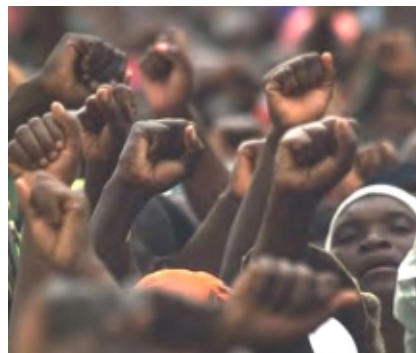
ZANU-PF rally, March 7.

It is, of course, ZANU-PF’s mismanagement and corruption that have brought misery and famine to what was once one of Africa’s best-run economies. After strangling the formerly profitable mining sector, Mr. Mugabe turned on white farmers. Whites are virtually the only people in Zimbabwe who run commercial rather than subsistence farms. They accounted for the country’s