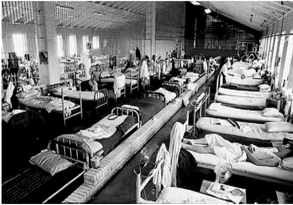
Open dormitory in a Texas prison.

"I had no choice but to submit to being Inmate B's prison wife. Out of fear for my life, I submitted to sucking his dick, being fucked in my ass, and performing other duties as a woman, such as making his bed. In all reality, I was his slave . . . I determined I'd be better