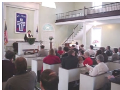
They're all white.

work. “I can't take this anymore,” she says, of being the only white woman. “There's no one like me.” She was mortified when she organized a church picnic and the Koreans would not touch her bean salad.