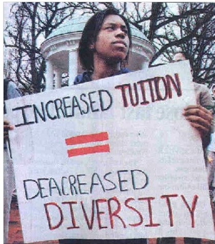
In January, the University of North Carolina at Chapel Hill announced a $400 increase in tuition for the 2002-2003 academic year, prompting the above warning. “Decreasing” diversity well may lift academic standards.