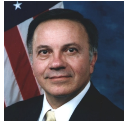
Congressman Thomas Tancredo.

David Keene , who is best known as the sponsor of the annual C-PAC gathering of conservatives, gave a reasonably good overview of the effects of the 1965 immigration law. He reminded us that its sponsors promised it would neither increase the rate of immigration nor change the ethnic mix of the country. He said we would have few immigration-related problems if we had maintained the pre-1965 rates of 300,000 or so rather than trying to stuff 1,000,000 new people into the country every year. He said the country is being Balkanized by immigrants who seem to have little desire to assimilate, and who are poorer and less educated than natives. He added that it makes no sense for 70 percent of all legal immigrants to be coming for family reunification rather than because we want them. He said the basic questions should be: How many people do we need, whom do we want, and do they