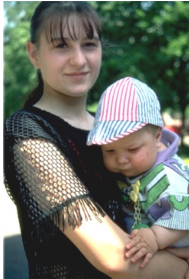
Problem or possibility?

“non-Hispanic whites”) are 60.9 percent of the American population age 17 and younger, in 1999 whites accounted for just 44.3 percent—a minority—of births