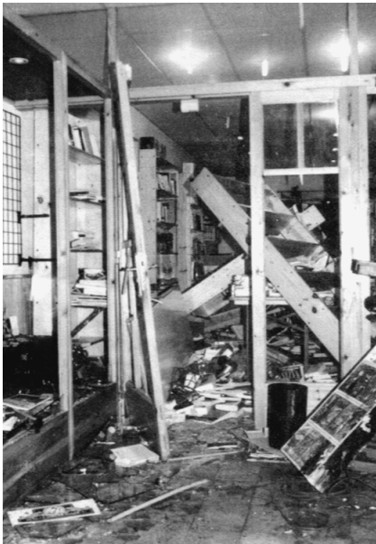
How the 'anti-fascists' left the Europa bookstore.