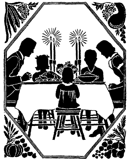
National day of mourning?

Once children are older, there are countless techniques for attacking “the dominant culture,” and the book suggests particularly lively ways to take the stuffing out of whites. Children can pretend to be Congressmen debating the Indian Removal Act of 1830, or can try to think of all the evil motives for the Chinese Exclusion Acts of the 19th century. They should put on a mock trial of “the profit system” as the cause of the drug trade, as they consider “drugs as a weapon against the Black community.” Students can draw cartoons about the “racism” they experience, or can collect tourist brochures about Hawaii and note that they fail to mention that whites seized the islands and raped the culture. They can discuss why Thanksgiving Day can be thought of as a day of mourning, or take turns answering the question: “What is your earliest recollection of being excluded because of your race or culture?” Whites can keep diaries of the unearned privileges they enjoy each