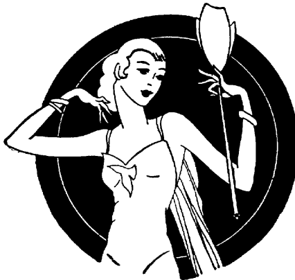
White skin privilege.

The “crits” do not yet control society but they control what they teach: “All aspects of the curriculum [must] integrate multicultural, critical thinking and justice concepts and practice.” “Diversity and equity issues are integrated into all aspects of the teacher-training curriculum.” This is necessary because, as one of the editors of the book puts it with breath-taking finality, “The purpose of education in an unjust society is to bring about equality and justice.” Thus,