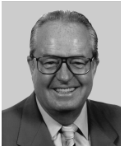
Jean-Marie Le Pen.

is one of the most capable. For the last several years he has been the most prominent of Mr. Le Pen's inner circle, and has been considered to be the most likely successor to the 70-year-old president of the party.