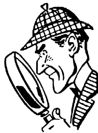
Hunting for “racism.”

The great riddle is why white-majority societies permit this, why whites have lost the ability to take their own side in an argument. The unhappy truth seems to be that this potentially fatal disability is found in every white country that has opened itself to multi-racialism. W