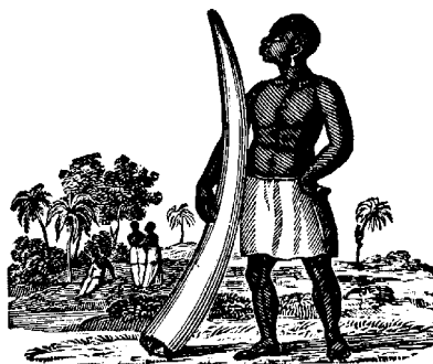
Africa's early exports.

For the French, defeat in the Franco-Prussian War in 1871 was an important catalyst. Having lost Alsace and Lorraine to the Germans, they hoped to rebuild national prestige through overseas exertion; some politicians even dreamed of getting back the lost provinces by offering chunks of Africa to the Germans. Also, after the socialist uprising of the Paris Commune immediately after the war, French politicians thought distant bits