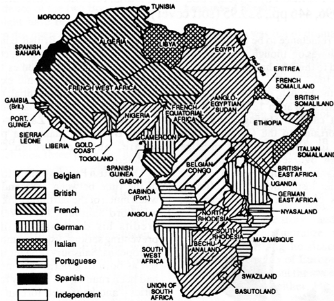
Africa in 1914

without its catastrophes for the British, and it was one of the these that had brought Kitchener to the Sudan in the first place. Britain had stumbled into control of Egypt in 1882, at a point when Egypt had just taken over the Sudan. The Sudanese were not keen on either the British or the Egyptians, and the fuzzy-wuzzies (properly known as the mahdists) were making trouble. Charles George "Chinese" Gordon, the copy-book model of the eminent Victorian, went to Khartoum in 1885 to restore order but was killed in a siege. Gordon's death was a tremendous shock; it was hardly assuaged when the leader of the victorious mahdists later wrote to Queen Victoria, inviting her to come to the Sudan, submit to him, and convert to Islam. It took the British 14 years to avenge the death of Gordon, but they took care of the French on the same trip.